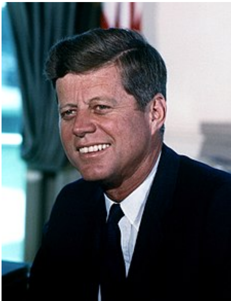
John Fitzgerald Kennedy

Liberals are supportive of gay couples to get equal rights like everyone else (e.g. marriage); abortion should be legal; support embryonic stem cell research. Support restrictions and regulation around the right to bear arms.