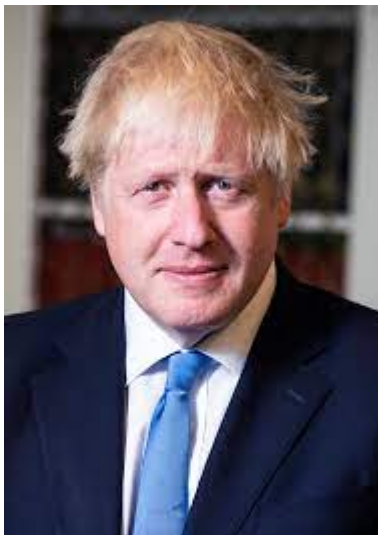
Boris Johnson (conservative)

Conservatives are opposed to gay marriage, abortion and embryonic stem cell research. They support personal responsibility as an individual.